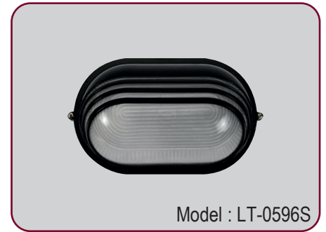
Model : LT-0596S