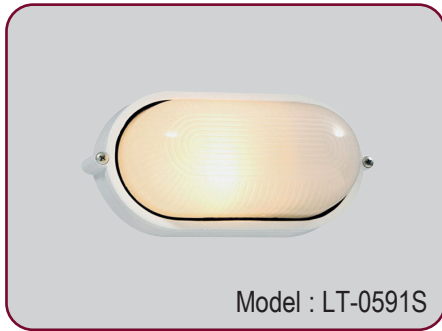
Model : LT-0591S